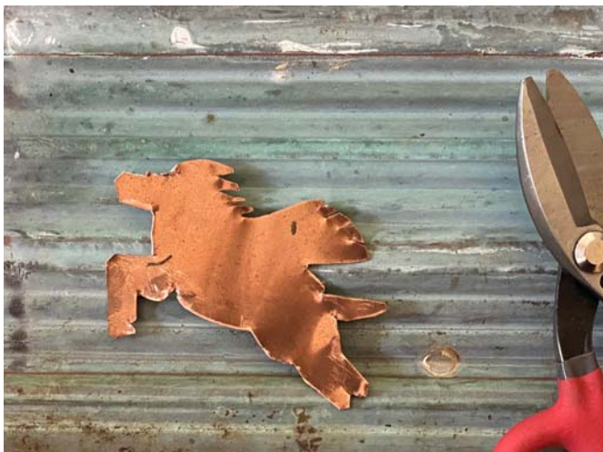
Flight of fancy from emergency studio

"Threat of covid19 and Governor's wisdom made me shelter in place in Bethesda. Missing friends and the big sky over Rappahannock County. Scrambling for scrap metal!"