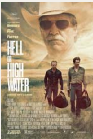
Click on the photo below to play the movie trailer