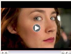
Movie trailer Click on the lower photo to play the video