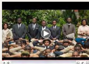
Click on the small photo to play the video.