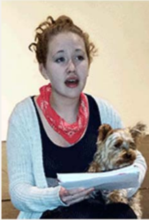
Dorothy (Winnie Thompson) rehearses with Toto (Twinkie Maskas)