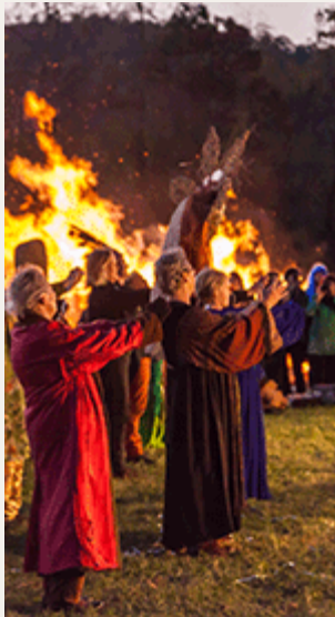
1000 Faces Mask Theater takes a bow.