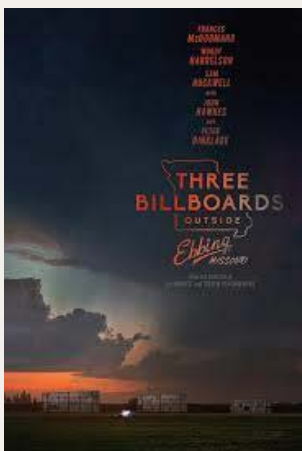
Click on the photo below to play the movie trailer