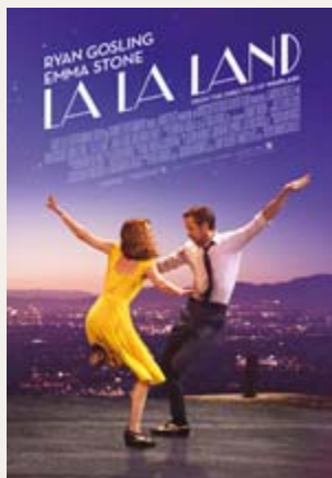
Click on the photo below to play the movie trailer