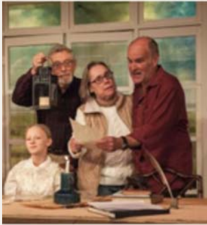
Bottom: Some members of the cast on the set.