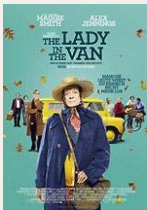
Movie trailer Click on the photo below to play the video